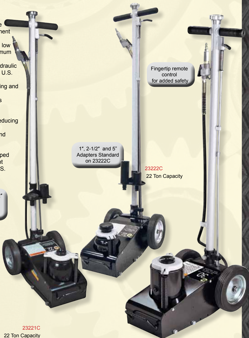
23221C 22 Ton Capacity

Fingertip remote control for added safety